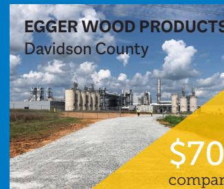
EGGER WOOD PRODUCTS Davidson County

NCRR invested in land preparation for a lead track that not only provides rail access for Weitron but also opens a new rail-served industrial park.