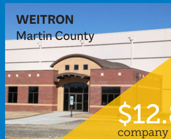
WEITRON Martin County